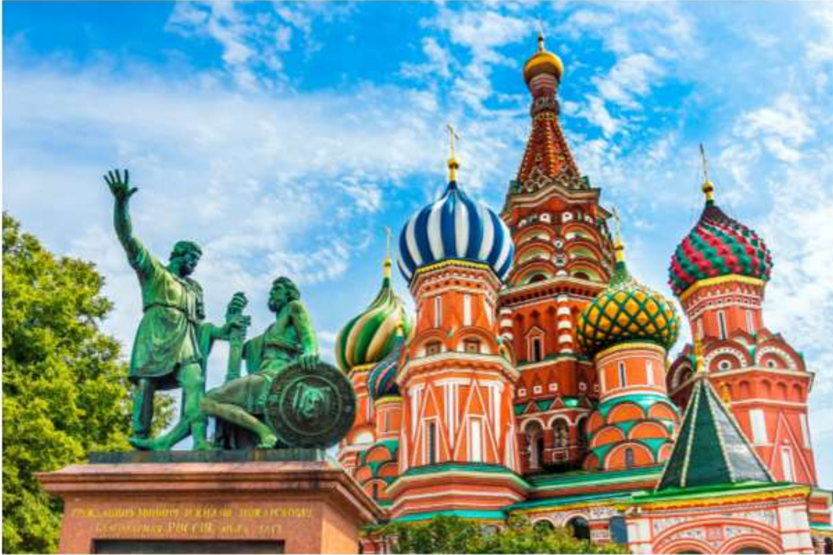
Russia – St Basil's Cathedral