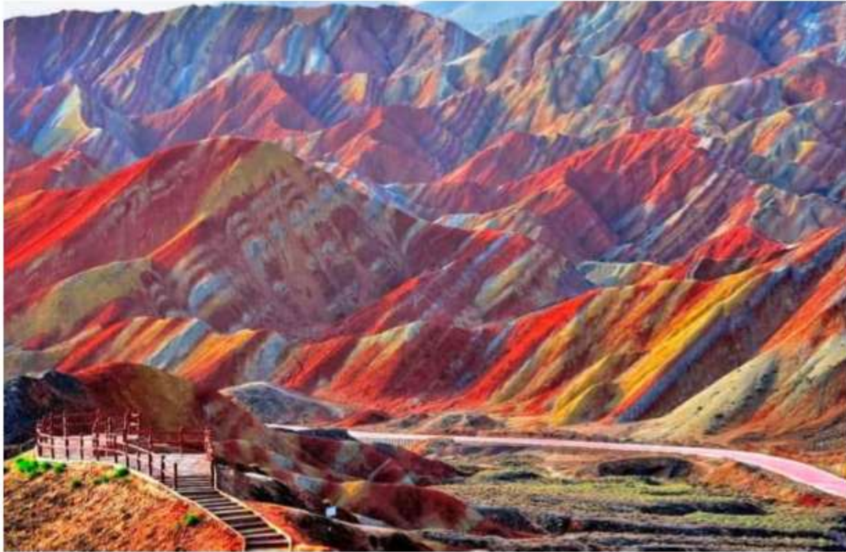
China - Zhangye Danxia Geopark