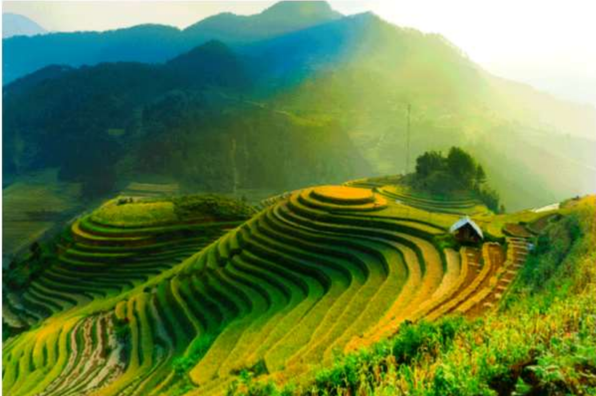
Vietnam – Mu Cang Chai