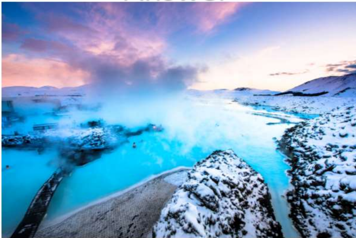
Iceland – Blue Lagoon