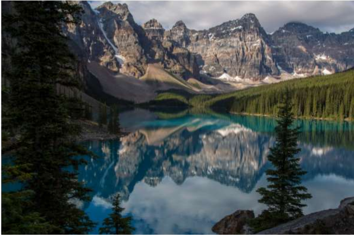
Canada - Banff national park