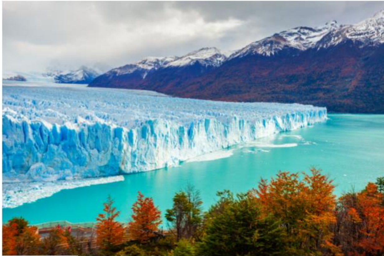
Perito Moreno Glacier in Argentina