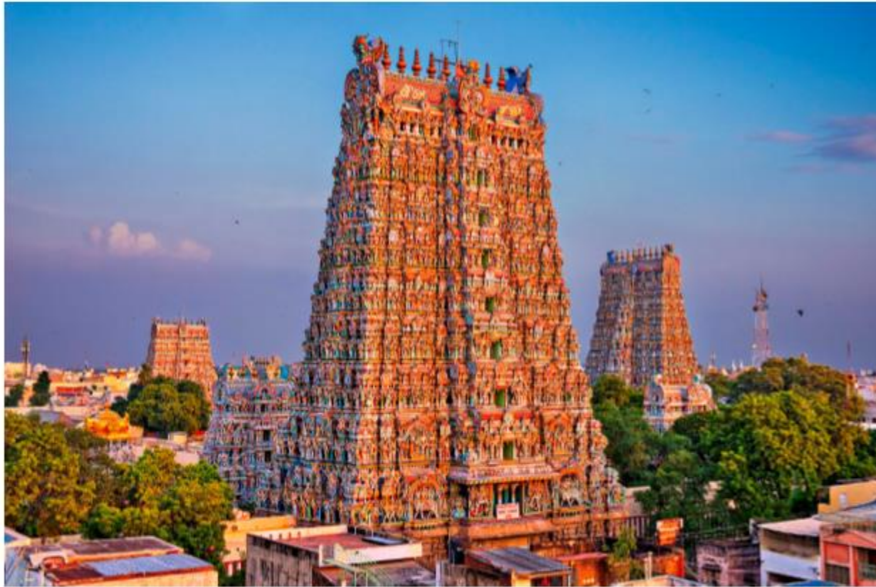
Meenakshi Temple in India