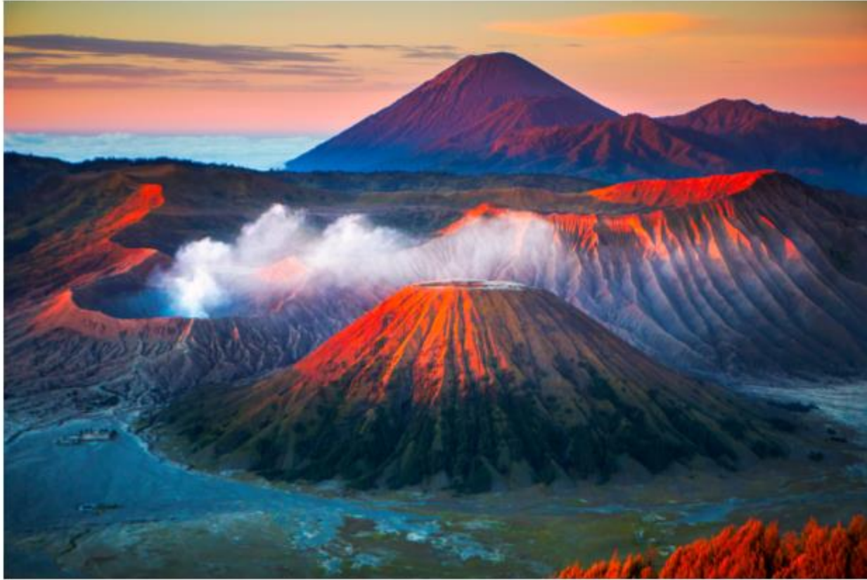
Mount Bromo in Indonesia