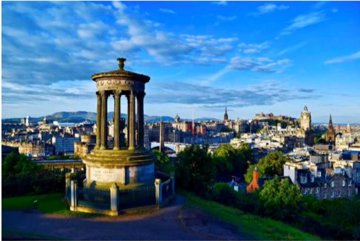
Carlton Hill in Edinburgh, Scotland