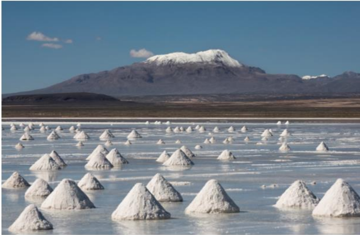
Salar de Uyuni in Bolivia