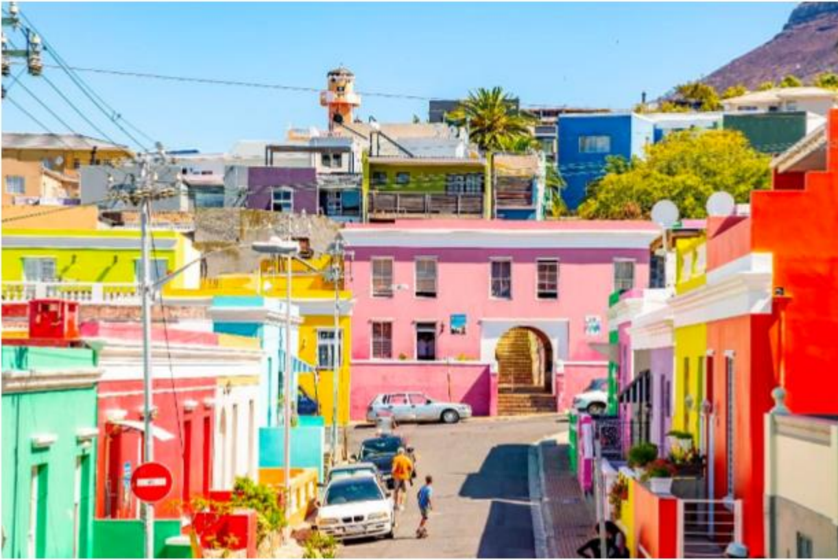
Bo Kaap in Cape Town, South Africa