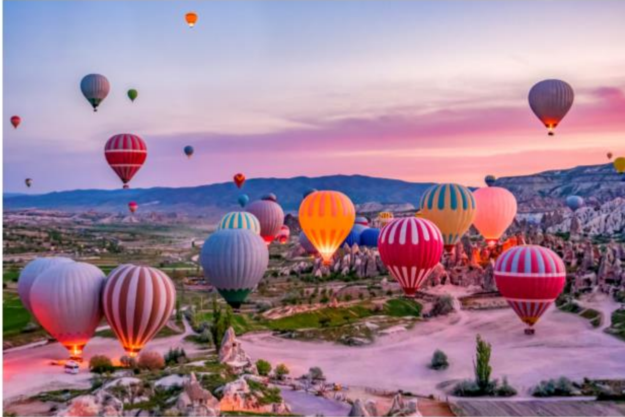
Cappadocia in Turkey