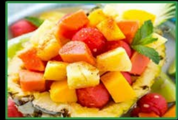
Mango Fruit Cocktail