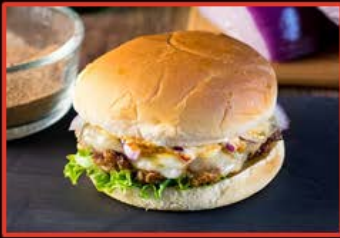
Jerk Pork Burger