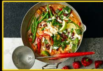
Caribbean Vegetable Curry